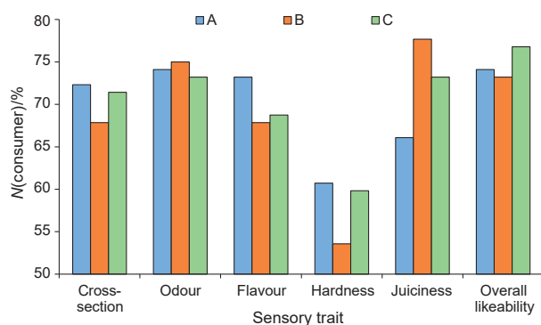
Fig. 3. Percentage of consumers scoring sensory traits with high likeability. A= Enterococcus durans ED0207, B= Lactococcus lactis ssp. cremoris LL8307, C=non-inoculated control